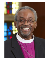
BISHOP MICHAEL CURRY